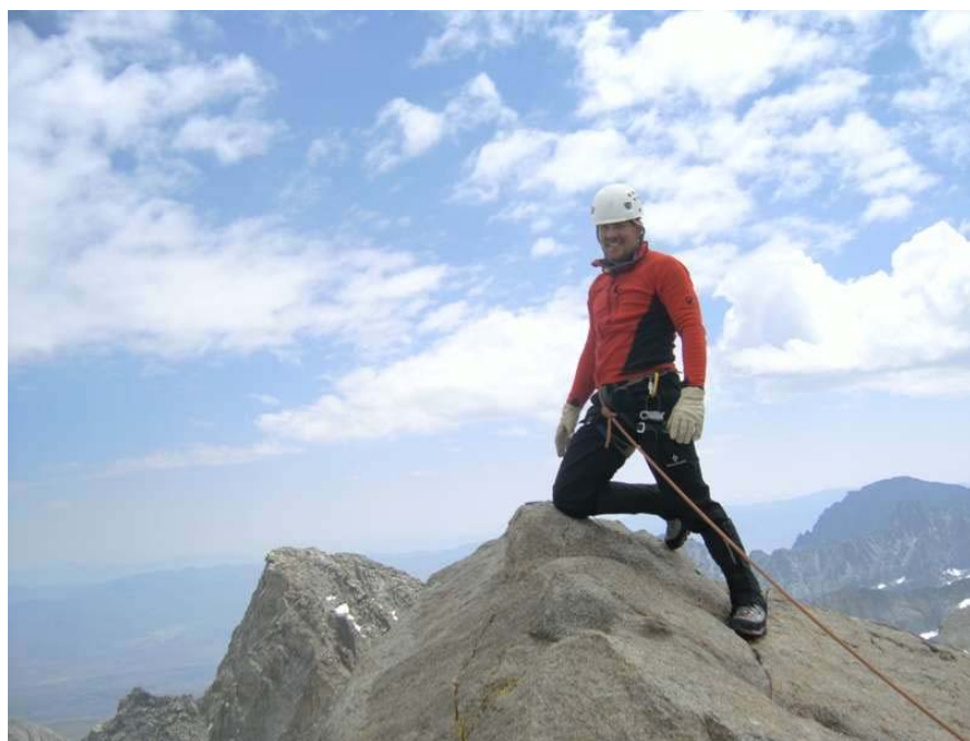
SMG: Doing our part to find a cure for Summit Fever.